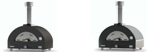
Black Powder Coat Stainless Steel