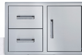
SINGLE DOOR WITH DOUBLE DRAWER