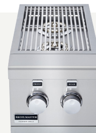
SIDE BURNER - DOUBLE