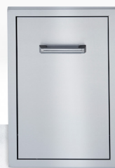
DRAWER FOR ROLL-OUT WASTE CONTAINER

Enhance your built-in with stainless steel doors and drawers for added grilling space and convenient storage. Durable and weather-resistant, these drawers provide ample room to store tools, sauces, and other grilling essentials, keeping everything you need within easy reach.