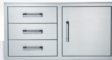
SINGLE DOOR WITH TRIPLE DRAWER