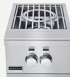
SIDE BURNER - POWER