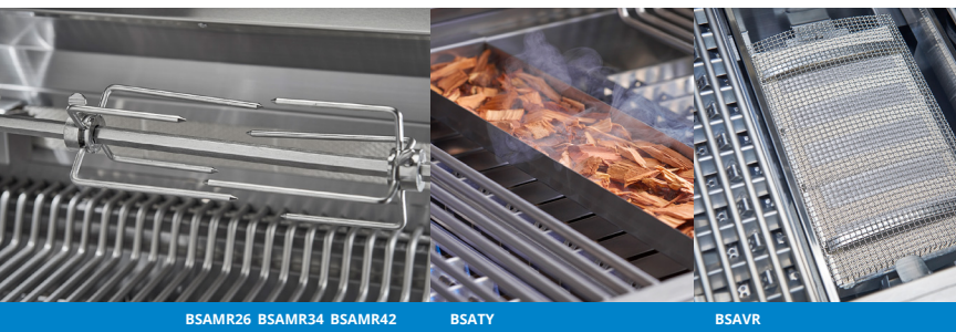
BSAMR26 BSAMR34 BSAMR42