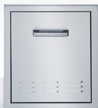
SINGLE DRAWER FOR PROPANE TANK

Expand your cooking selections. Whether you're preparing a full meal or just adding extra flavor, Broilmaster side burners provide the flexibility you need for a complete outdoor cooking experience.