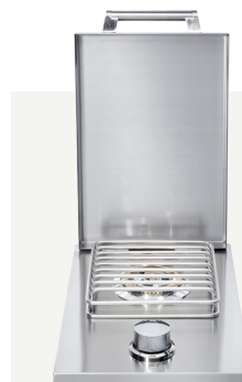
SIDE BURNER - DROP-IN