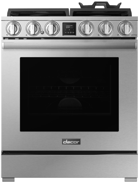
DOP30T840GS/DA - Silver Stainless, Natural Gas/Liquid Propane